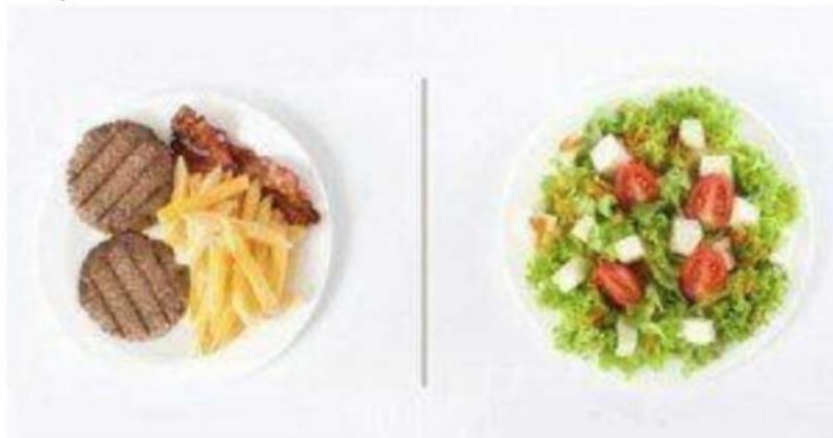
Figure 3: Two contrasting foods: processed meats and high fat/carbohydrates vs. vegetables and soybean