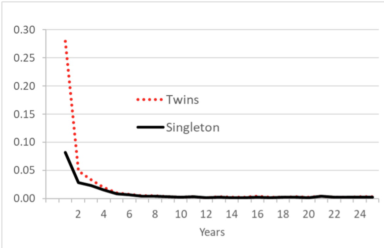
Fig. 2. Mortality of twins and singletons by age (in years) – 34 countries in sub-Saharan Africa

Source: Demographic and Health Surveys, 1990-2013 (Pongou, Shapiro, and Tenikue 2019)